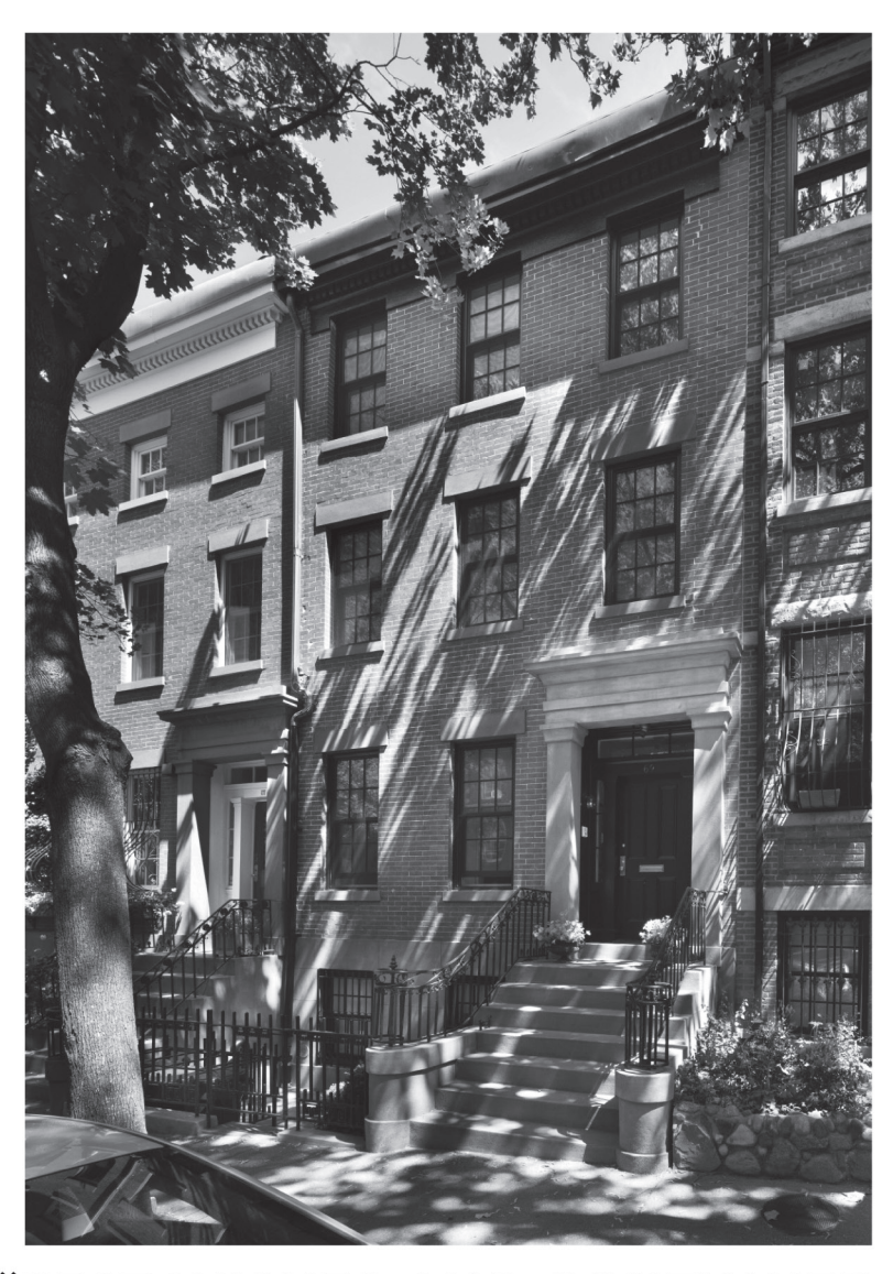
"BEST WISHES AND CONTINUED GOOD WORK TO THE HISTORIC DISTRICTS COUNCIL"