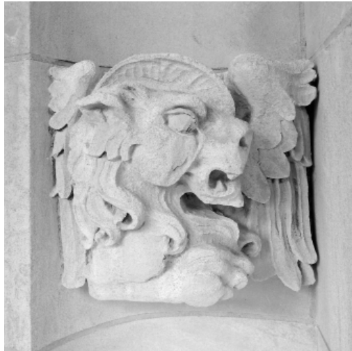
Detail, Central Presbyterian Church Restoration by WBMA, 2017-20