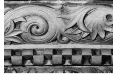
FRANK E. SANCHIS III

Friends of the Upper East Side Historic Districts, founded in 1982, is an independent, not-for-profit membership organization dedicated to preserving the architectural legacy, livability, and sense of place of the Upper East Side.