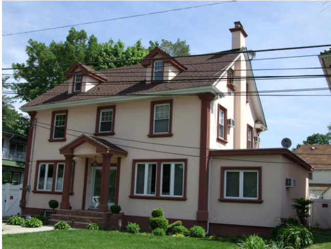
Photo number: 2 Address: 115-29 179 th Street Cross streets: between Linden Blvd and 114 th Road, east side of street Date built: 1914 Notes, if any: none

Photo number: 1 Address: 115-33 179 th Street Cross streets: Northeast corner of Linden Blvd. Date built: c. 1920 Notes, if any: none