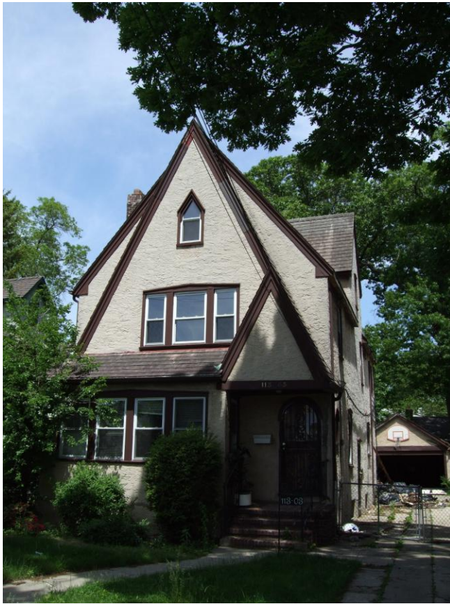
Photo number: 119 Address: 113-03 175 th Street Cross streets: between Murdock Avenue and Adelaide, east side of street Date built: 1927 Notes, if any: none