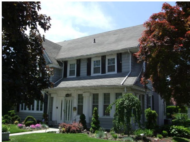
Photo number: 30 Address: 114-44 179 th Street Cross streets: between 114 th Road and Murdock, west side of street Date built: 1920 Notes, if any: none