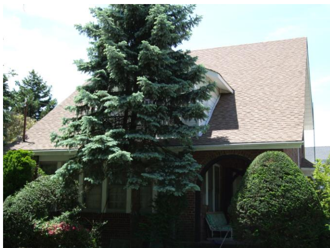
Photo number: 31 Address: 114-52 179 th Street Cross streets: between 114 th Road and Murdock, west side of street Date built: 1926 Notes, if any: none

Photo number: 30 Address: 114-44 179 th Street Cross streets: between 114 th Road and Murdock, west side of street Date built: 1920 Notes, if any: none