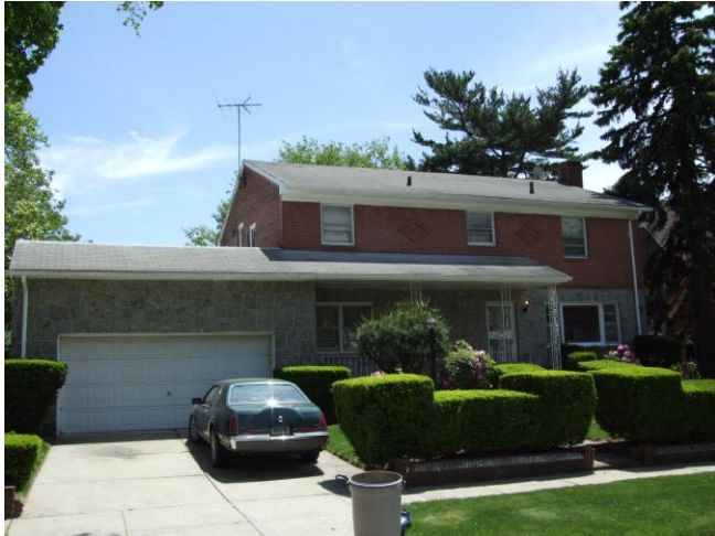
Photo number: 95 Address: 175-40 Murdock Avenue Cross streets: between 176 th Street and 175 th Place, south side of street Date built: 1959 Notes, if any: none

Photo number: 94 Address: 175-46 Murdock Avenue Cross streets: Southwest corner of 176 th Street Date built: c. 1925 Notes, if any: Owned by St. Albans Congregational Church