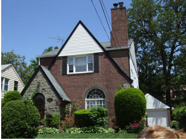
Photo number: 74 Address: 112-27 177 th Street Cross streets: between Murdock and 112 th Avenue, east side of street Date built: c. 1930 Notes, if any: former home of vocalist Herbert Mills of the Mills Brothers

Photo number: 73 Address: 112-35 177 th Street Cross streets: between Murdock and 112 th Avenue, east side of street Date built: 1938 Notes, if any: none