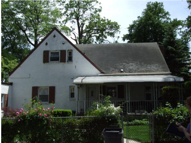
Photo number: 116 Address: 174-02 Murdock Avenue Cross streets: Southeast corner of 174 th Street Date built: 1935 Notes, if any: none

Photo number: 115 Address: 173-07 Murdock Avenue Cross streets: Northwest corner of Marne Place Date built: 1928 Notes, if any: none