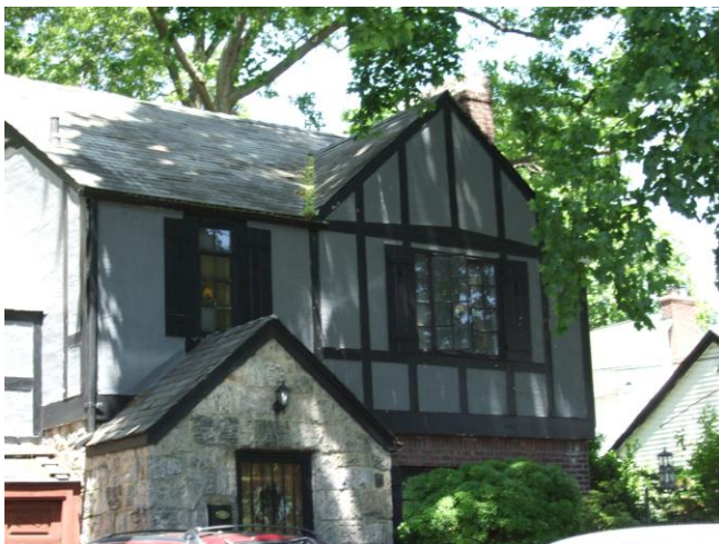
Photo number: 60 Address: 178-33 Murdock Avenue Cross streets: between 179 th Street and 178 th Place, north side of street Date built: 1924 Notes, if any: none

Photo number: 59 Address: 178-41 Murdock Avenue Cross streets: Northwest corner of 179 th Street Date built: c. 1930 Notes, if any: none