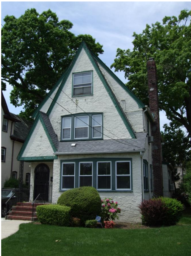
Photo number: 102 Address: 175-07 Murdock Avenue Cross streets: between 175 th Place and 175 th Street, north side of street Date built: 1927 Notes, if any: none