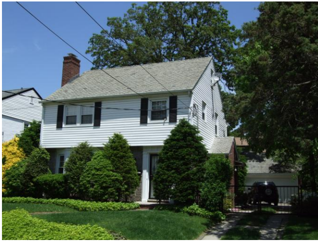
Photo number: 73 Address: 112-35 177 th Street Cross streets: between Murdock and 112 th Avenue, east side of street Date built: 1938 Notes, if any: none