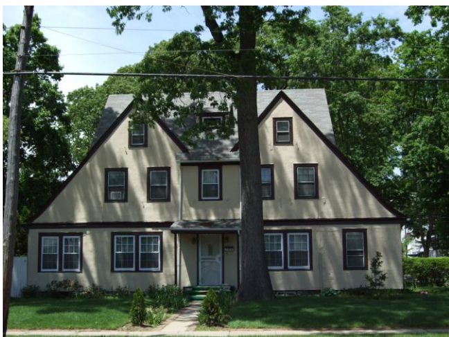
Photo number: 97 Address: 175-47 Murdock Avenue Cross streets: Northwest corner of 176 th Street Date built: c. 1925 Notes, if any: none

Photo number: 96 Address: 175-30 Murdock Avenue Cross streets: Southeast corner of 175 th Place Date built: c. 1930 Notes, if any: none