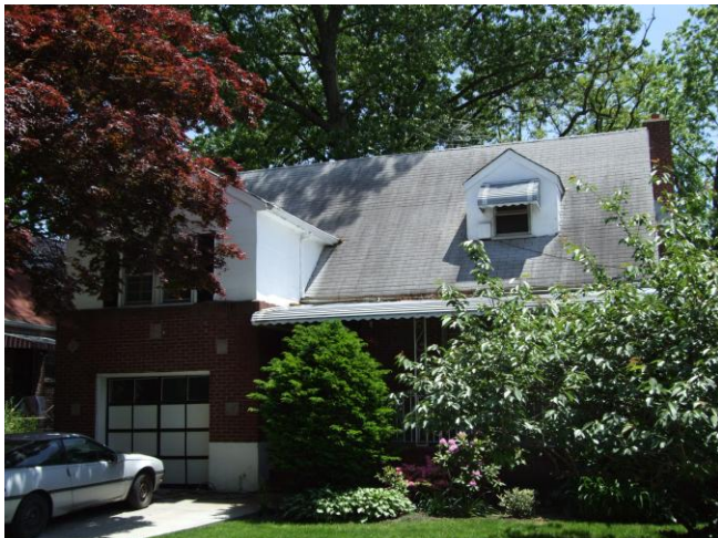
Photo number: 67 Address: 177-14 Murdock Avenue Cross streets: between 178 th Street and 177 th Street, south side of street Date built: 1958 Notes, if any: none

Photo number: 66 Address: 114-02 178 th Street Cross streets: Southwest corner of Murdock Avenue Date built: 1924 Notes, if any: none