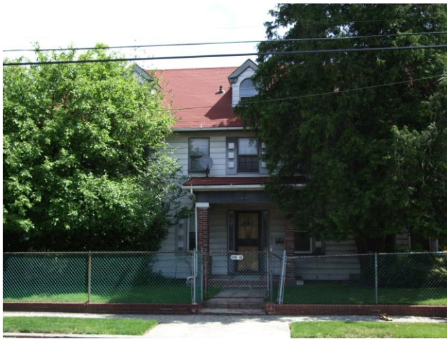
Photo number: 13 Address: 114-61 179 th Street Cross streets: Northeast corner of 114 th Road Date built: 1917 Notes, if any: none