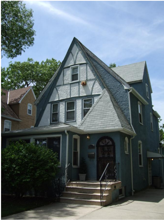
Photo number: 113 Address: 173-19 Murdock Avenue Cross streets: between 175 th Street and Marne Place, north side of street Date built: 1927 Notes, if any: none