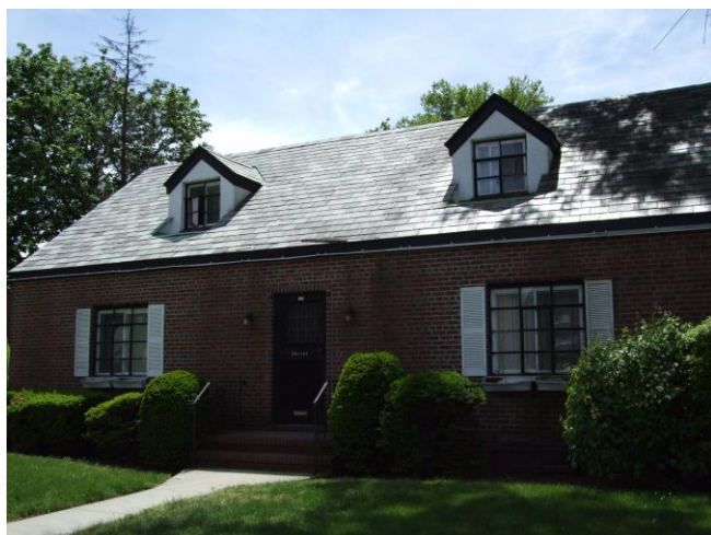
Photo number: 129 Address: 174-27 Adelaide Road Cross streets: Southwest corner of 175 th Street Date built: c. 1940 Notes, if any: none

Photo number: 128 Address: 174-27 Adelaide Road Cross streets: Northwest corner of 175 th Street Date built: 1935 Notes, if any: former home of jazz musician William "Count" Basie