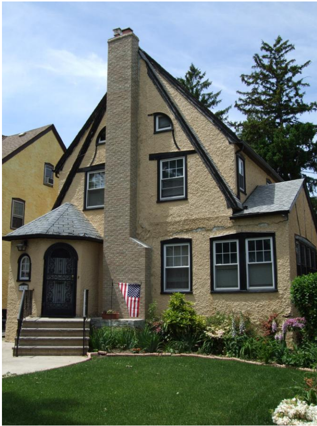
Photo number: 107 Address: 174-19 Murdock Avenue Cross streets: between 175 th Street and Marne Place, north side of street Date built: 1927 Notes, if any: none