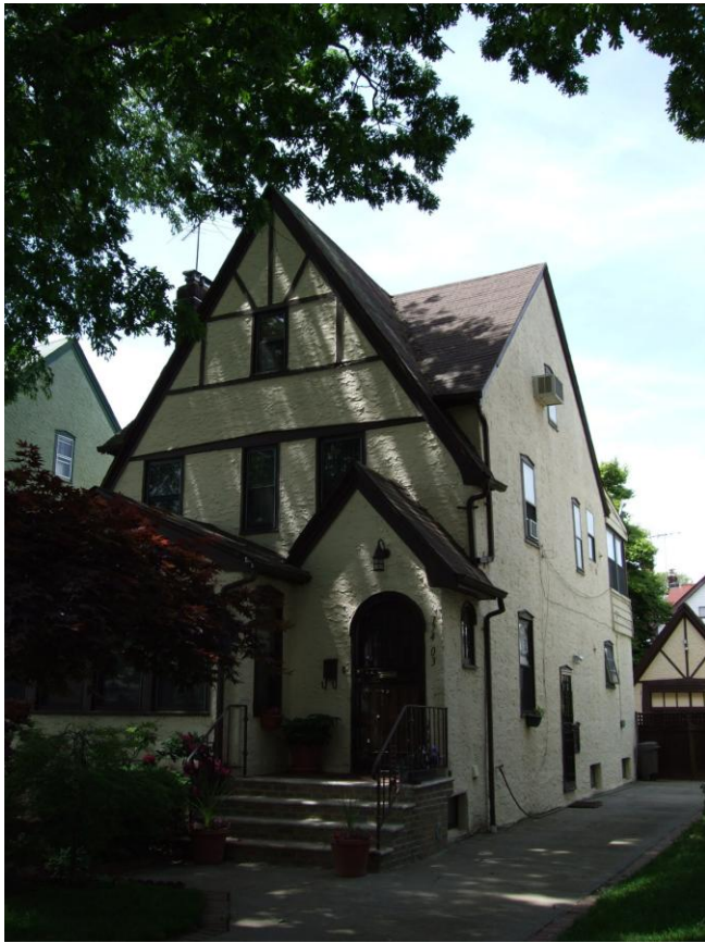
Photo number: 111 Address: 174-03 Murdock Avenue Cross streets: between 175 th Street and Marne Place, north side of street Date built: 1927 Notes, if any: none