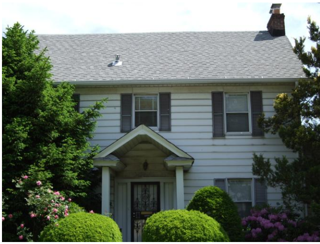
Photo number: 20 Address: 114-27 179 th Street Cross streets: between 114 th Road and Murdock, east side of street Date built: 1920 Notes, if any: none