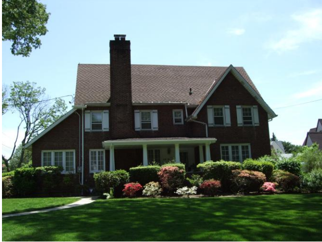
Photo number: 62 Address: 178-16 Murdock Avenue Cross streets: Southwest corner of 178 th Place Date built: c. 1930 Notes, if any: former home of jazz musician Earl Bostic

Photo number: 61 Address: 112-55 178 th Place Cross streets: Northeast corner of Murdock Avenue Date built: c. 1930 Notes, if any: none