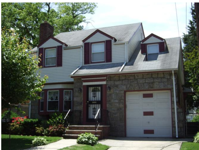
Photo number: 85 Address: 112-20 177 th Street Cross streets: between Murdock and 112 th Avenue, west side of street Date built: 1937 Notes, if any: none

Photo number: 84 Address: 112-16 177 th Street Cross streets: between Murdock and 112 th Avenue, west side of street Date built: 1937 Notes, if any: none