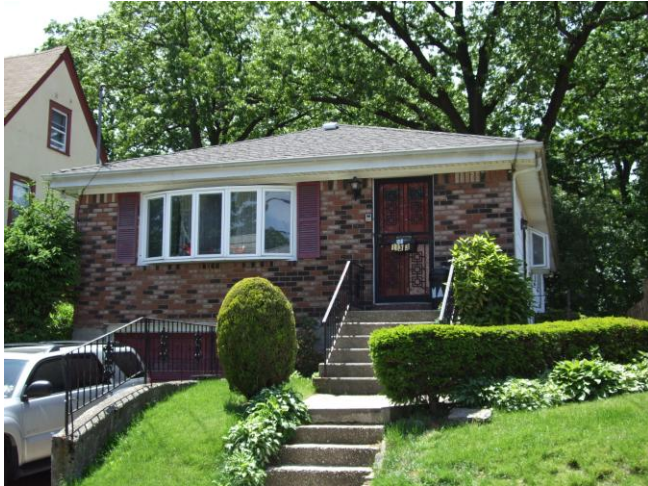
Photo number: 87 Address: 112-32 177 th Street Cross streets: between Murdock and 112 th Avenue, west side of street Date built: 1965 Notes, if any: none

Photo number: 86 Address: 112-24 177 th Street Cross streets: between Murdock and 112 th Avenue, west side of street Date built: 1925, demolished 2008 Notes, if any: none