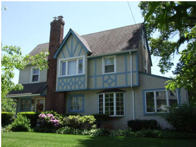
Photo number: 56 Address: 179-07 Murdock Avenue Cross streets: Southwest corner of 179 th Street Date built: c. 1920 Notes, if any: none

Photo number: 55 Address: 179-07 Murdock Avenue Cross streets: Northeast corner of 179 th Street Date built: c. 1930 Notes, if any: former home of singer Ella Fitzgerald and jazz musician Ray Brown