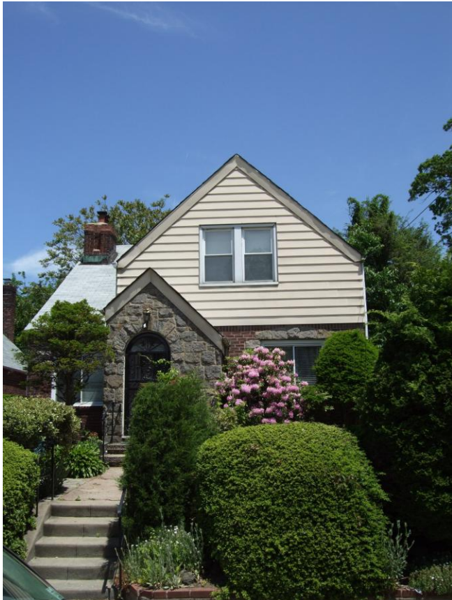
Photo number: 75 Address: 112-23 177 th Street Cross streets: between Murdock and 112 th Avenue, east side of street Date built: c. 1930 Notes, if any: none

Photo number: 74 Address: 112-27 177 th Street Cross streets: between Murdock and 112 th Avenue, east side of street Date built: c. 1930 Notes, if any: former home of vocalist Herbert Mills of the Mills Brothers