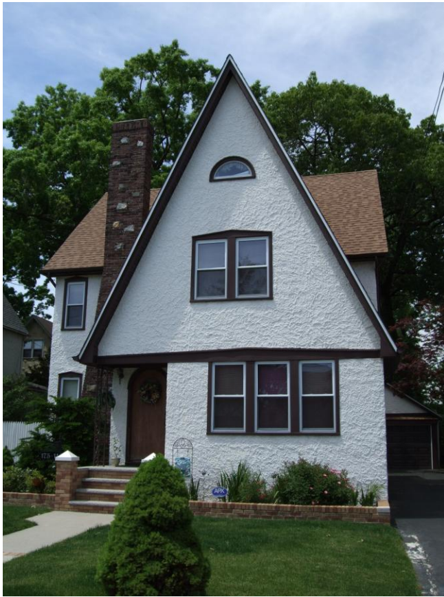
Photo number: 101 Address: 175-11 Murdock Avenue Cross streets: between 175 th Place and 175 th Street, north side of street Date built: 1927 Notes, if any: none