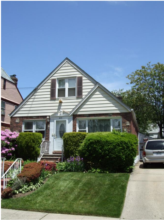
Photo number: 76 Address: 112-19 177 th Street Cross streets: between Murdock and 112 th Avenue, east side of street Date built: 1954 Notes, if any: none