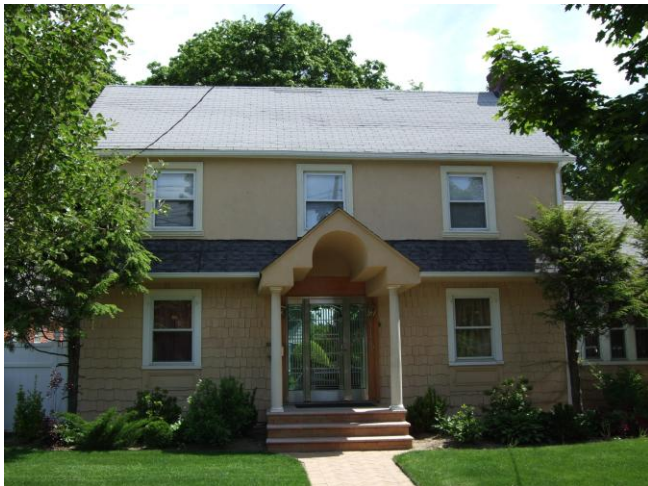
Photo number: 15 Address: 114-41 179 th Street Cross streets: between 114 th Road and Murdock, east side of street Date built: 1930 Notes, if any: none