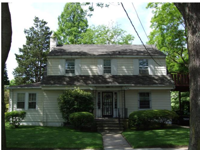
Photo number: 8 Address: 114-80 179 th Street Cross streets: between Linden Blvd and 114 th Road, west side of street Date built: 1914 Notes, if any: none

Photo number: 7 Address: 114-66 179 th Street Cross streets: between Linden Blvd and 114 th Road, west side of street Date built: c. 1920 Notes, if any: none