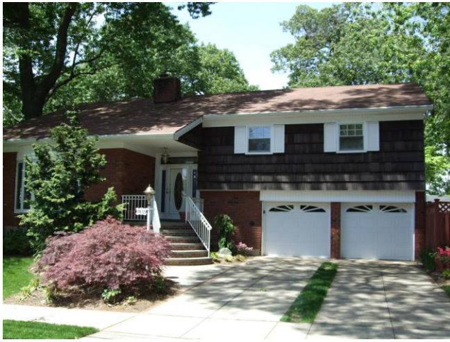
Photo number: 65 Address: 178-05 Murdock Avenue Cross streets: Northeast corner of 178 th Street Date built: 1963 Notes, if any: none