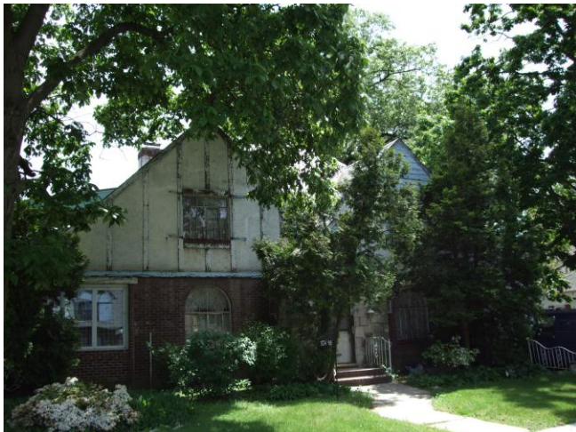
Photo number: 117 Address: 174-16 Murdock Avenue Cross streets: Southwest corner of 175 th Street Date built: 1927 Notes, if any: none

Photo number: 116 Address: 174-02 Murdock Avenue Cross streets: Southeast corner of 174 th Street Date built: 1935 Notes, if any: none