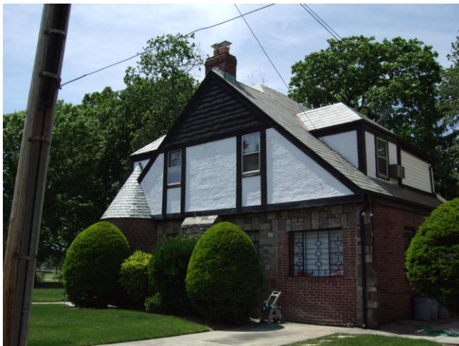
Photo number: 137 Address: 173-05 113 th Avenue Cross streets: Northeast corner of Marne Place Date built: 1929 Notes, if any: former home of jazz musician Milt Hinton