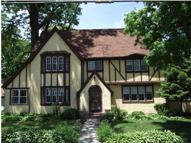
Photo number: 92 Address: 176-15 Murdock Avenue Cross streets: Northwest corner of 177 th Street Date built: c. 1925 Notes, if any: none

Photo number: 91 Address: 176-06 Murdock Avenue Cross streets: Southeast corner of 176 th Street Date built: c. 1925 Notes, if any: none