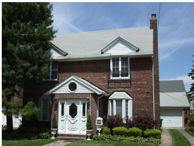
Photo number: 126 Address: 112-21 175 th Street Cross streets: between Murdock Avenue and Adelaide, east side of street Date built: 1927 Notes, if any: none

Photo number: 125 Address: 112-25 175 th Street Cross streets: between Murdock Avenue and Adelaide, east side of street Date built: 1927 Notes, if any: none