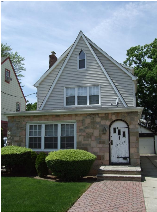
Photo number: 135 Address: 173-15 113 th Avenue Cross streets: between 175 th Street and Marne Place, north side of street Date built: c. 1930 Notes, if any: none