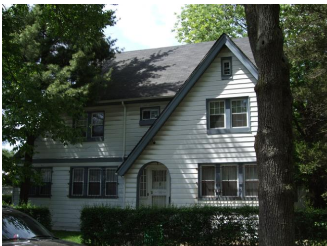
Photo number: 12 Address: 115-16 179 th Street Cross streets: between Linden Blvd and 114 th Road, west side of street Date built: c.1920 Notes, if any: none

Photo number: 11 Address: 115-14 179 th Street Cross streets: between Linden Blvd and 114 th Road, west side of street Date built: 1920 Notes, if any: none