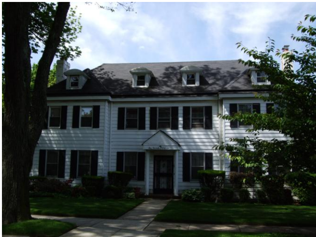
Photo number: 7 Address: 114-66 179 th Street Cross streets: between Linden Blvd and 114 th Road, west side of street Date built: c. 1920 Notes, if any: none

Photo number: 6 Address: 114-83 179 th Street Cross streets: between Linden Blvd and 114 th Road, east side of street Date built: 1919 Notes, if any: none