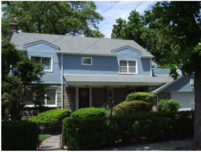
Photo number: 98 Address: 175-37 Murdock Avenue Cross streets: Northeast corner of 175 th Place Date built: 1949 Notes, if any: former home of vocalist Brook Benton