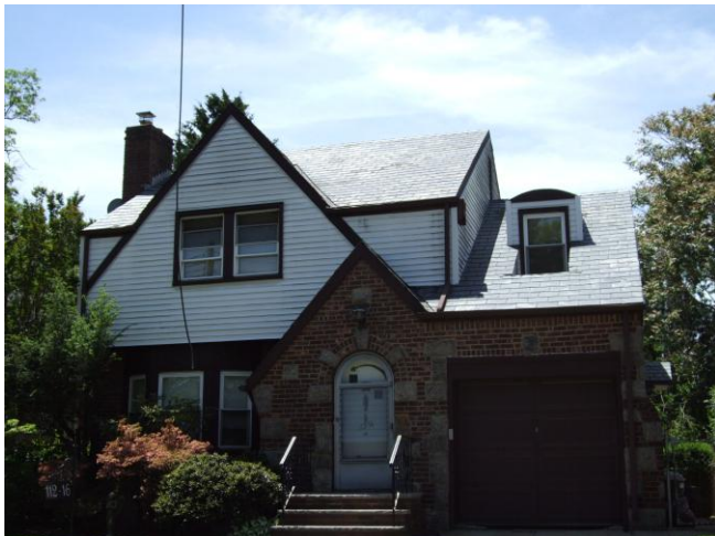
Photo number: 84 Address: 112-16 177 th Street Cross streets: between Murdock and 112 th Avenue, west side of street Date built: 1937 Notes, if any: none

Photo number: 83 Address: 112-12 177 th Street Cross streets: between Murdock and 112 th Avenue, west side of street Date built: 1937 Notes, if any: none