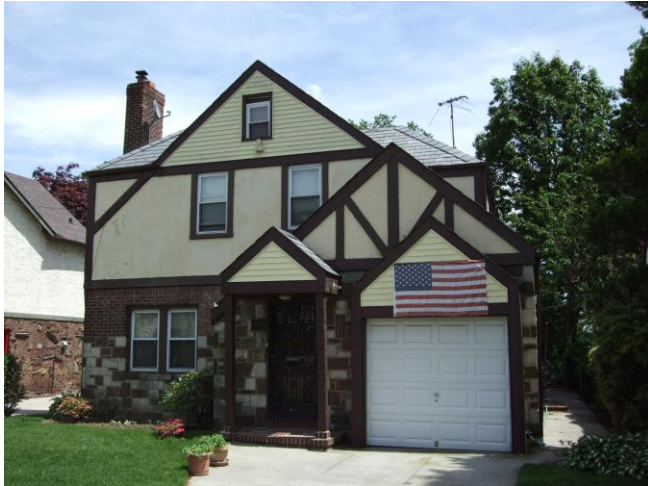
Photo number: 139 Address: 173-06 113 th Avenue Cross streets: between 175 th Street and Marne Place, south side of street Date built: 1935 Notes, if any: none