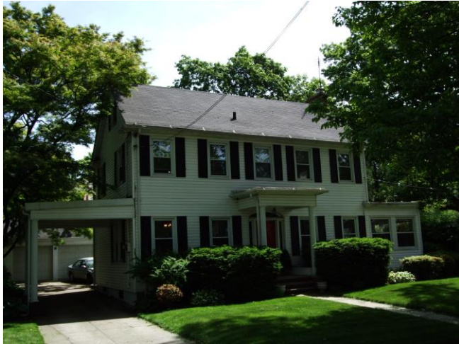
Photo number: 6 Address: 114-83 179 th Street Cross streets: between Linden Blvd and 114 th Road, east side of street Date built: 1919 Notes, if any: none

Photo number: 5 Address: 114-91 179 th Street Cross streets: between Linden Blvd and 114 th Road, east side of street Date built: 1917 Notes, if any: none