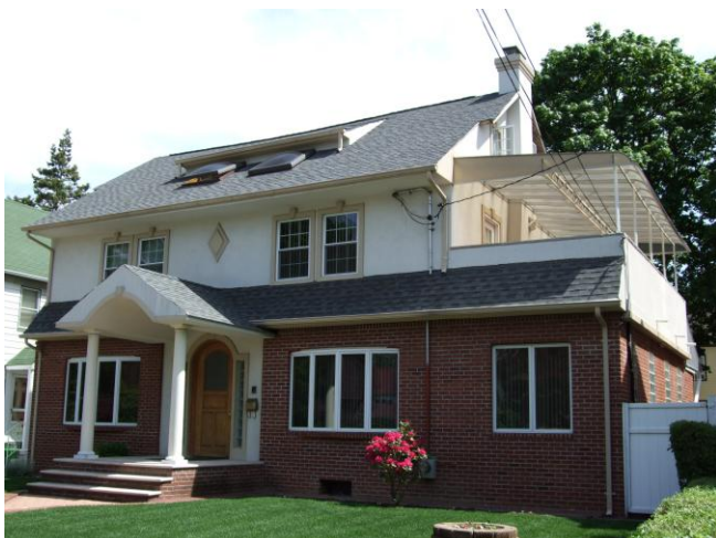
Photo number: 16 Address: 114-37 179 th Street Cross streets: between 114 th Road and Murdock, east side of street Date built: 1916 Notes, if any: none