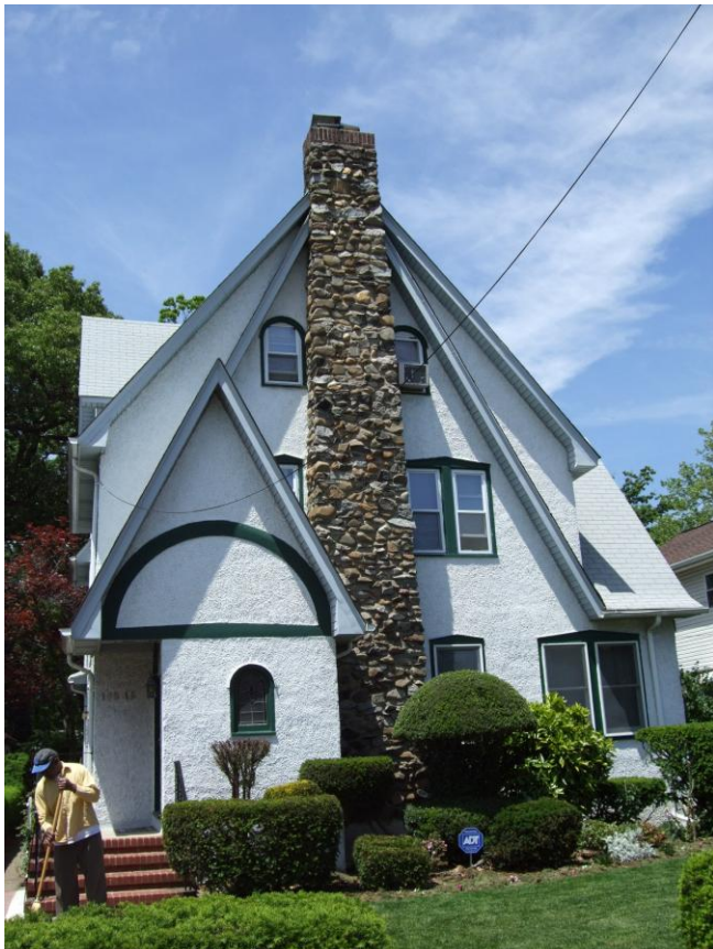
Photo number: 100 Address: 175-15 Murdock Avenue Cross streets: between 175 th Place and 175 th Street, north side of street Date built: 1927 Notes, if any: none

Photo number: 99 Address: 112-80 175 th Place Cross streets: Northwest corner of Murdock Avenue Date built: c. 1960 Notes, if any: none