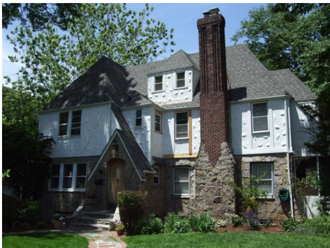
Photo number: 64 Address: 178-15 Murdock Avenue Cross streets: Northwest corner of 178 th Place Date built: c. 1920 Notes, if any: none

Photo number: 63 Address: 178-06 Murdock Avenue Cross streets: Southeast corner of 178 th street Date built: c. 1930 Notes, if any: none