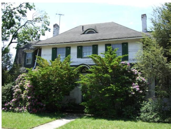
Photo number: 32 Address: 114-60 179 th Street Cross streets: between 114 th Road and Murdock, west side of street Date built: 1914 Notes, if any: none

Photo number: 31 Address: 114-52 179 th Street Cross streets: between 114 th Road and Murdock, west side of street Date built: 1926 Notes, if any: none