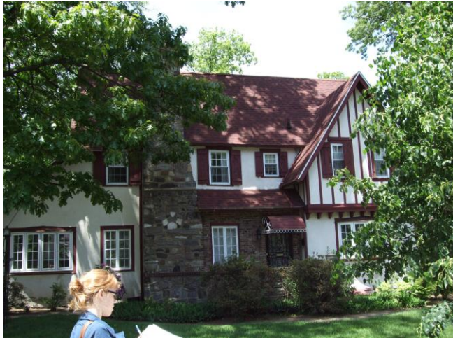
Photo number: 93 Address: 176-05 Murdock Avenue Cross streets: Northeast corner of 177 th Street Date built: c. 1925 Notes, if any: none

Photo number: 92 Address: 176-15 Murdock Avenue Cross streets: Northwest corner of 177 th Street Date built: c. 1925 Notes, if any: none