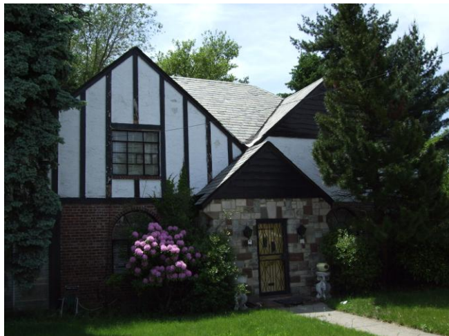
Photo number: 128 Address: 174-27 Adelaide Road Cross streets: Northwest corner of 175 th Street Date built: 1935 Notes, if any: former home of jazz musician William "Count" Basie