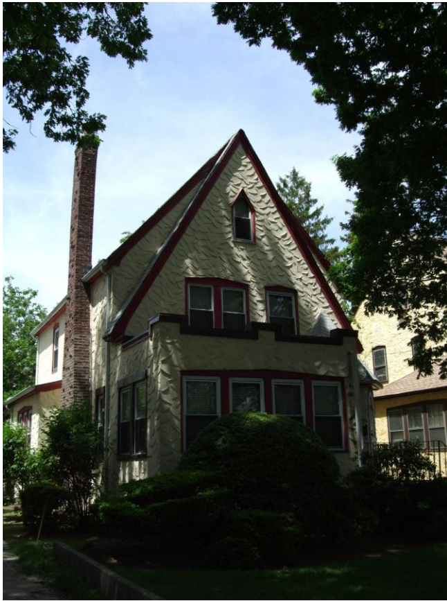
Photo number: 109 Address: 174-11 Murdock Avenue Cross streets: between 175 th Street and Marne Place, north side of street Date built: 1927 Notes, if any: none