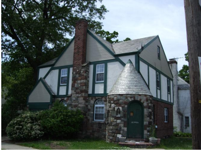
Photo number: 147 Address: 174-15 Linden Boulevard Cross streets: Northwest corner of 175 th Street Date built: 1928 Notes, if any: none

Photo number: 146 Address: 113-02 175 th Street Cross streets: Southwest corner of 113 th Avenue Date built: 1935 Notes, if any: former home of jazz musician Mercer Ellington