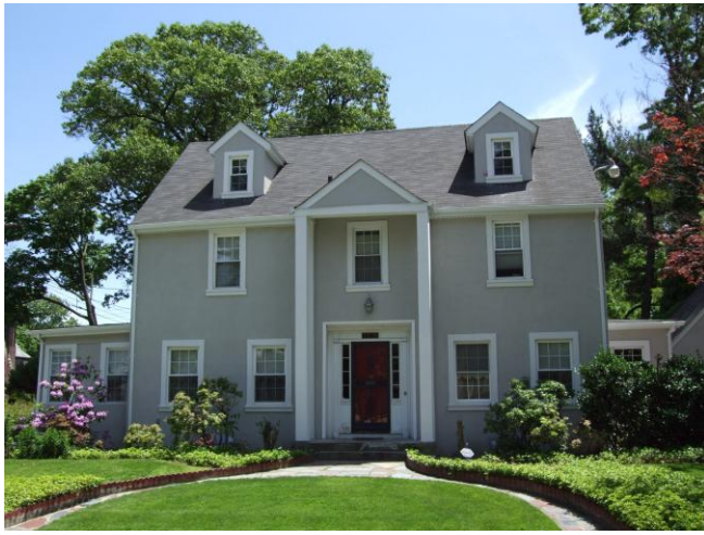
Photo number: 90 Address: 176-18 Murdock Avenue Cross streets: Southwest corner of 177 th Street Date built: 1928 Notes, if any: none