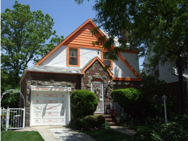
Photo number: 79 Address: 112-07 177 th Street Cross streets: between Murdock and 112 th Avenue, east side of street Date built: 1937 Notes, if any: none

Photo number: 78 Address: 112-11 177 th Street Cross streets: between Murdock and 112 th Avenue, east side of street Date built: 1937 Notes, if any: none