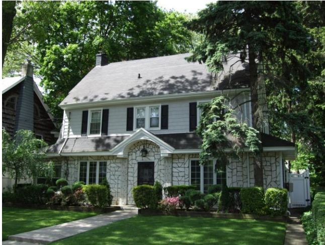
Photo number: 10 Address: 115-10 179 th Street Cross streets: between Linden Blvd and 114 th Road, west side of street Date built: c. 1920 Notes, if any: none

Photo number: 9 Address: 114-90 179 th Street Cross streets: between Linden Blvd and 114 th Road, west side of street Date built: 1916 Notes, if any: none