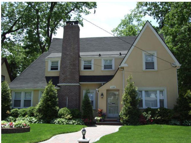
Photo number: 89 Address: 112-50 177 th Street Cross streets: between Murdock and 112 th Avenue, west side of street Date built: 1924 Notes, if any: none

Photo number: 88 Address: 112-40 177 th Street Cross streets: between Murdock and 112 th Avenue, west side of street Date built: 1924 Notes, if any: former home of baseball player Jackie Robinson