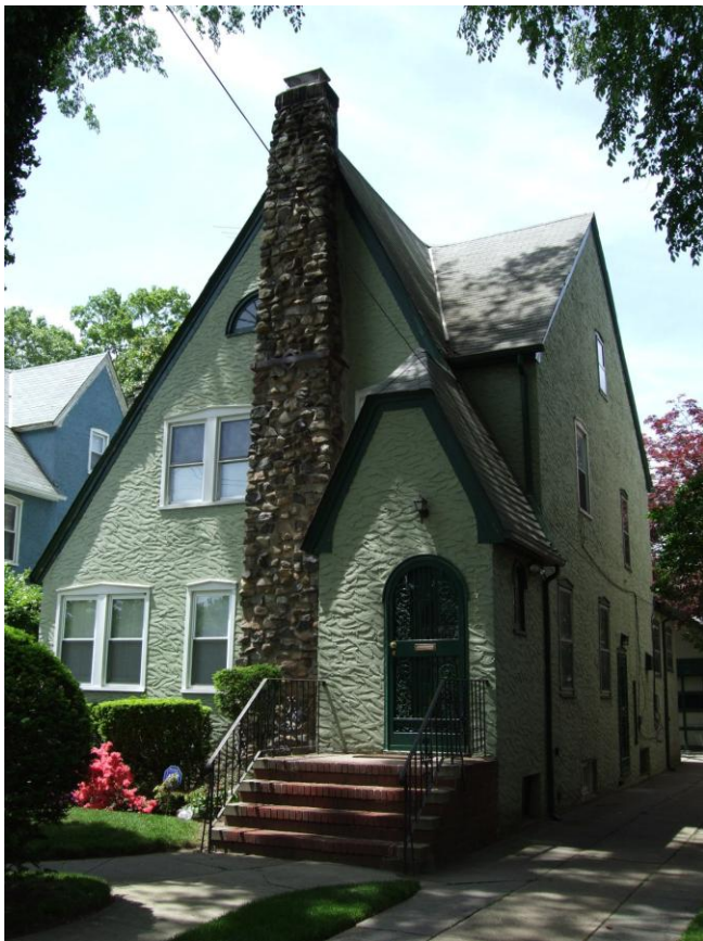
Photo number: 112 Address: 173-23 Murdock Avenue Cross streets: between 175 th Street and Marne Place, north side of street Date built: 1927 Notes, if any: none