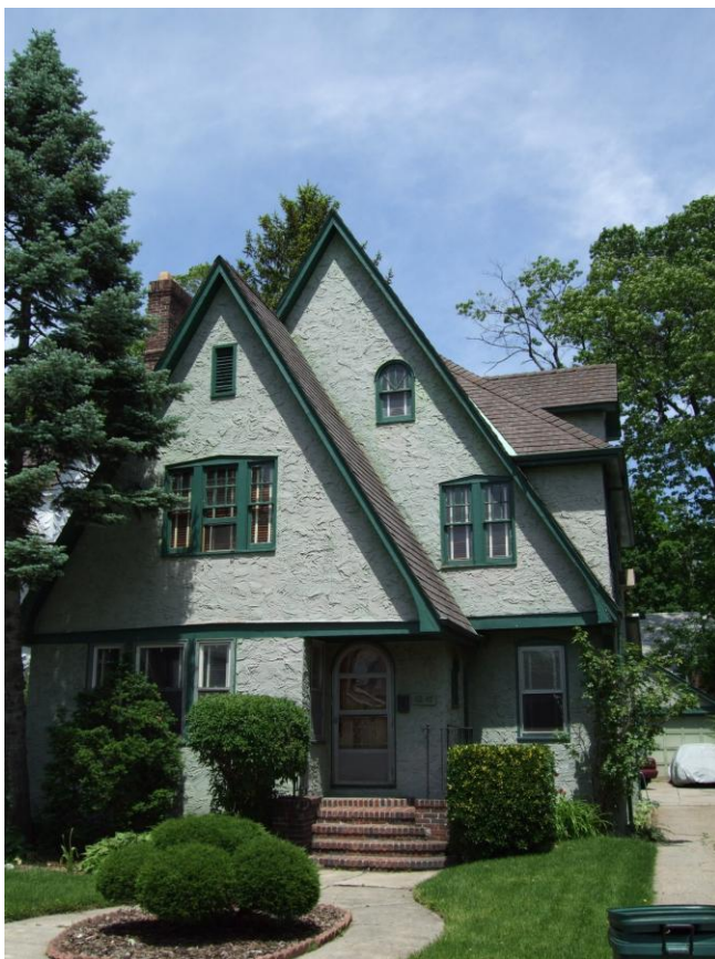
Photo number: 120 Address: 112-47 175 th Street Cross streets: between Murdock Avenue and Adelaide, east side of street Date built: 1927 Notes, if any: none

Photo number: 119 Address: 113-03 175 th Street Cross streets: between Murdock Avenue and Adelaide, east side of street Date built: 1927 Notes, if any: none