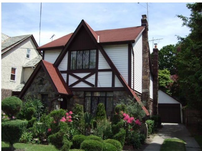
Photo number: 141 Address: 173-14 113 th Avenue Cross streets: between 175 th Street and Marne Place, south side of street Date built: c. 1930 Notes, if any: none

Photo number: 140 Address: 173-10 113 th Avenue Cross streets: between 175 th Street and Marne Place, south side of street Date built: 1931 Notes, if any: none