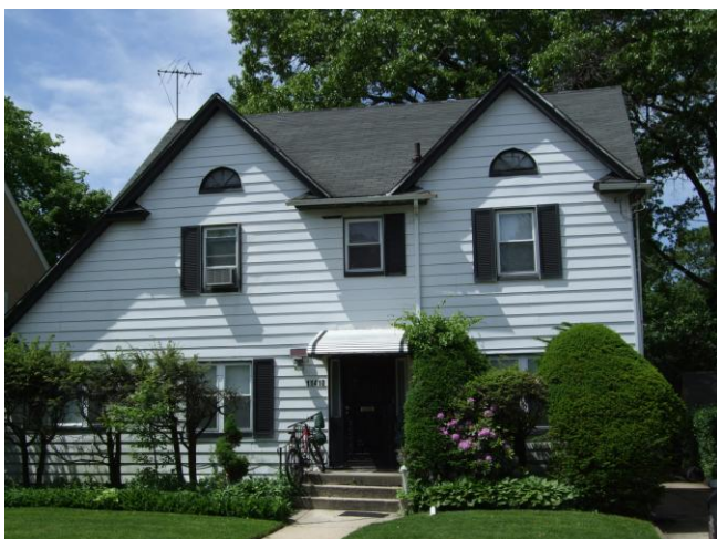
Photo number: 23 Address: 114-10 179 th Street Cross streets: between 114 th Road and Murdock, west side of street Date built: 1919 Notes, if any: former home of baseball player Roy Campanella

Photo number: 22 Address: 114-15 179 th Street Cross streets: between 114 th Road and Murdock, east side of street Date built: 1928 Notes, if any: none