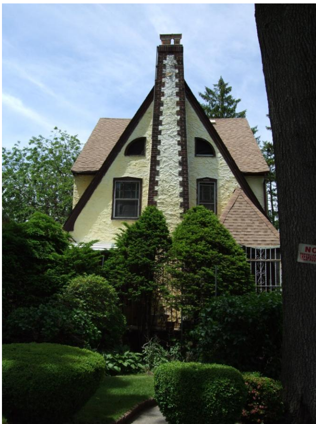
Photo number: 108 Address: 174-15 Murdock Avenue Cross streets: between 175 th Street and Marne Place, north side of street Date built: c. 1927 Notes, if any: none