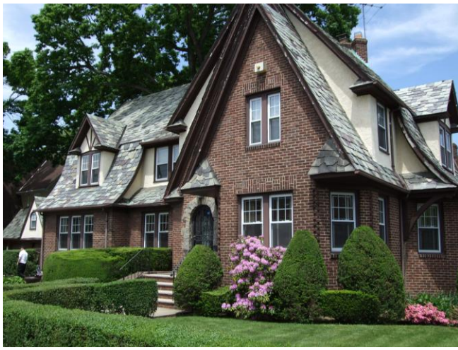
Photo number: 103 Address: 175-01 Murdock Avenue Cross streets: Northeast corner of 175 th Street Date built: c. 1920 Notes, if any: none