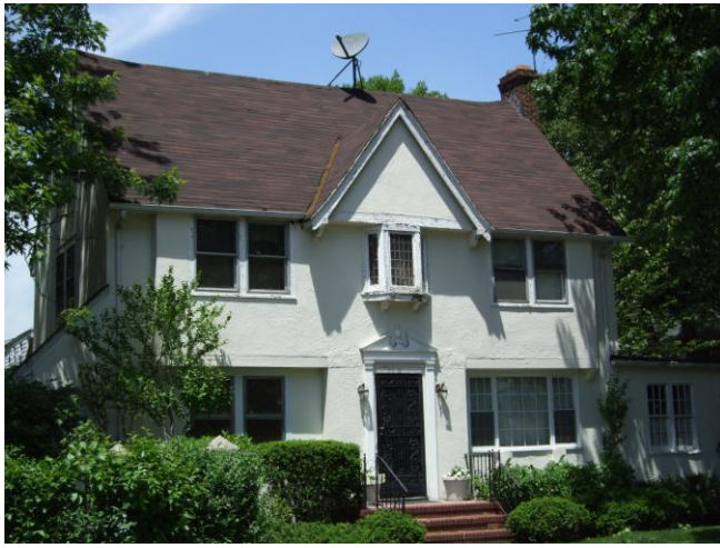
Photo number: 69 Address: 177-15 Murdock Avenue Cross streets: Northwest corner of 178 th Street Date built: c. 1920 Notes, if any: none