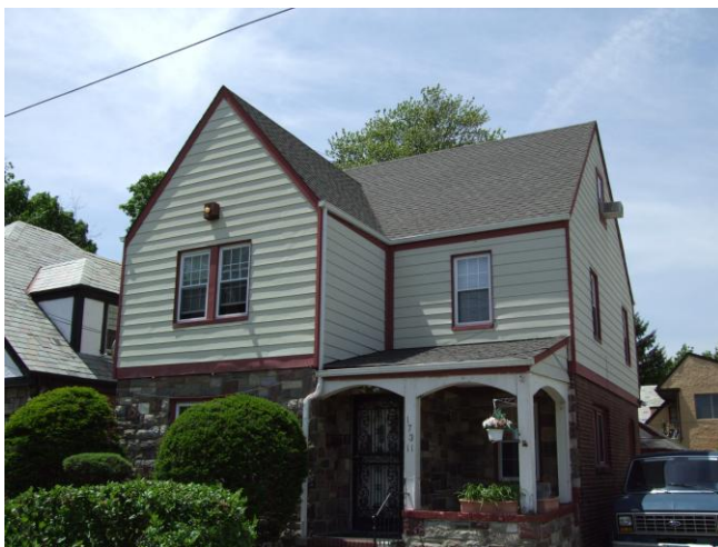
Photo number: 136 Address: 173-11 113 th Avenue Cross streets: between 175 th Street and Marne Place, north side of street Date built: c. 1930 Notes, if any: none