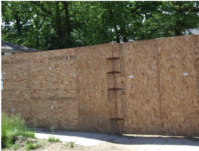
Photo number: 86 Address: 112-24 177 th Street Cross streets: between Murdock and 112 th Avenue, west side of street Date built: 1925, demolished 2008 Notes, if any: none