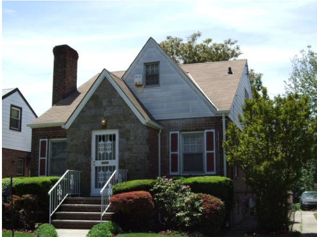
Photo number: 83 Address: 112-12 177 th Street Cross streets: between Murdock and 112 th Avenue, west side of street Date built: 1937 Notes, if any: none

Photo number: 82 Address: 112-06 177 th Street Cross streets: between Murdock and 112 th Avenue, west side of street Date built: 1937 Notes, if any: none