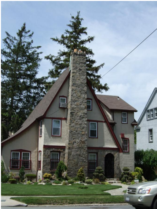
Photo number: 148 Address: 175-11 Linden Boulevard Cross streets: Northeast corner of 175 th Street Date built: 1928 Notes, if any: none

Photo number: 147 Address: 174-15 Linden Boulevard Cross streets: Northwest corner of 175 th Street Date built: 1928 Notes, if any: none