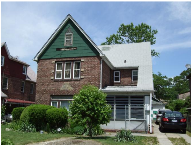
Photo number: 124 Address: 112-29 175 th Street Cross streets: between Murdock Avenue and Adelaide, east side of street Date built: 1927 Notes, if any: none

Photo number: 123 Address: 112-35 175 th Street Cross streets: between Murdock Avenue and Adelaide, east side of street Date built: 1927 Notes, if any: none