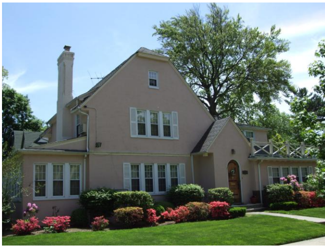
Photo number: 94 Address: 175-46 Murdock Avenue Cross streets: Southwest corner of 176 th Street Date built: c. 1925 Notes, if any: Owned by St. Albans Congregational Church