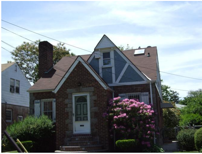
Photo number: 82 Address: 112-06 177 th Street Cross streets: between Murdock and 112 th Avenue, west side of street Date built: 1937 Notes, if any: none