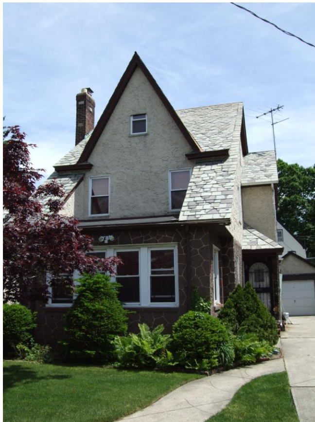
Photo number: 142 Address: 173-16 113 th Avenue Cross streets: between 175 th Street and Marne Place, south side of street Date built: 1929 Notes, if any: none