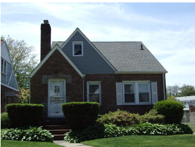
Photo number: 81 Address: 112-04 177 th Street Cross streets: between Murdock and 112 th Avenue, west side of street Date built: c. 1937 Notes, if any: none

Photo number: 80 Address: 112-03 177 th Street Cross streets: between Murdock and 112 th Avenue, east side of street Date built: 1937 Notes, if any: none