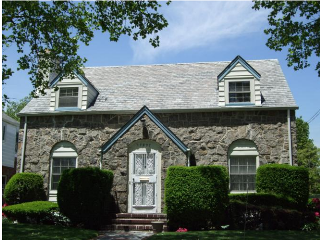
Photo number: 55 Address: 179-07 Murdock Avenue Cross streets: Northeast corner of 179 th Street Date built: c. 1930 Notes, if any: former home of singer Ella Fitzgerald and jazz musician Ray Brown

Photo number: 54 Address: 179-11 Murdock Avenue Cross streets: between 180 th and 179 th Streets, north side of street Date built: 1940 Notes, if any: none