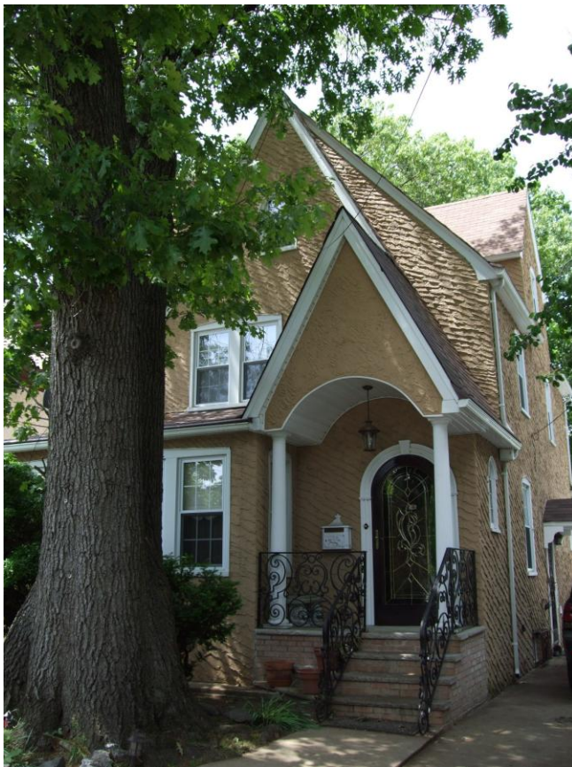
Photo number: 114 Address: 173-15 Murdock Avenue Cross streets: between 175 th Street and Marne Place, north side of street Date built: 1927 Notes, if any: none