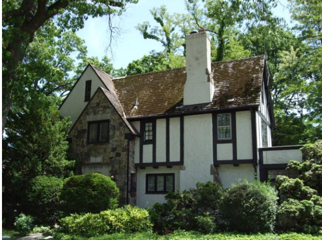
Photo number: 91 Address: 176-06 Murdock Avenue Cross streets: Southeast corner of 176 th Street Date built: c. 1925 Notes, if any: none

Photo number: 90 Address: 176-18 Murdock Avenue Cross streets: Southwest corner of 177 th Street Date built: 1928 Notes, if any: none