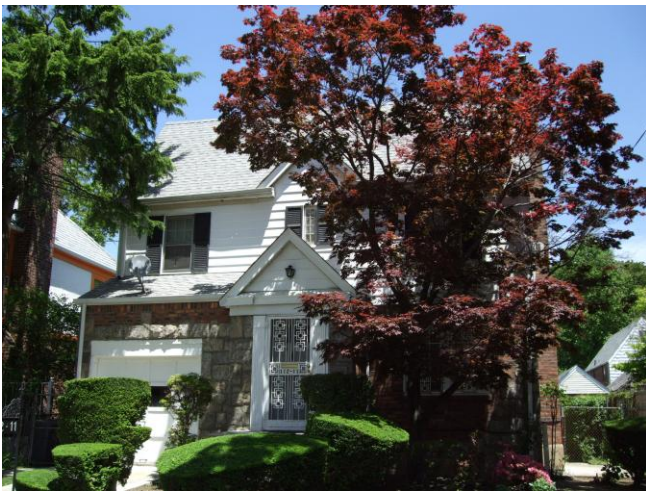
Photo number: 78 Address: 112-11 177 th Street Cross streets: between Murdock and 112 th Avenue, east side of street Date built: 1937 Notes, if any: none