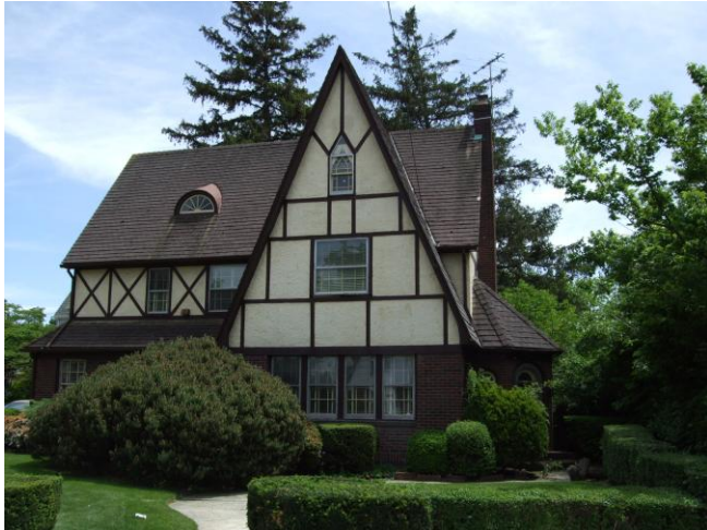
Photo number: 104 Address: 175-12 Murdock Avenue Cross streets: Southwest corner of 175 th Place Date built: 1928 Notes, if any: former home of boxer Joe Louis

Photo number: 103 Address: 175-01 Murdock Avenue Cross streets: Northeast corner of 175 th Street Date built: c. 1920 Notes, if any: none