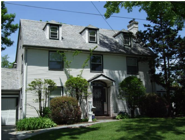
Photo number: 59 Address: 178-41 Murdock Avenue Cross streets: Northwest corner of 179 th Street Date built: c. 1930 Notes, if any: none

Photo number: 58 Address: 114-03 178 th Place Cross streets: Southeast corner of Murdock Avenue Date built: 1921 Notes, if any: none