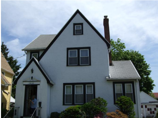
Photo number: 21 Address: 114-19 179 th Street Cross streets: between 114 th Road and Murdock, east side of street Date built: 1928 Notes, if any: former home of lawyer and politician Percy Sutton

Photo number: 20 Address: 114-27 179 th Street Cross streets: between 114 th Road and Murdock, east side of street Date built: 1920 Notes, if any: none