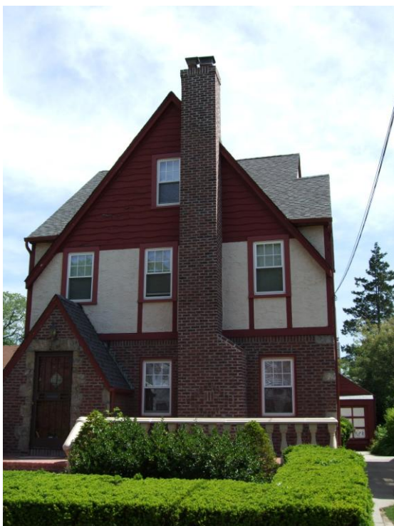
Photo number: 19 Address: 114-29 179 th Street Cross streets: between 114 th Road and Murdock, east side of street Date built: c. 1930 Notes, if any: none