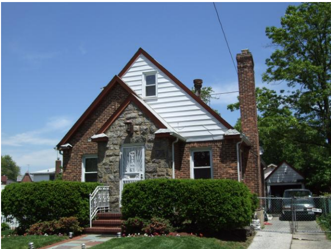
Photo number: 80 Address: 112-03 177 th Street Cross streets: between Murdock and 112 th Avenue, east side of street Date built: 1937 Notes, if any: none

Photo number: 79 Address: 112-07 177 th Street Cross streets: between Murdock and 112 th Avenue, east side of street Date built: 1937 Notes, if any: none