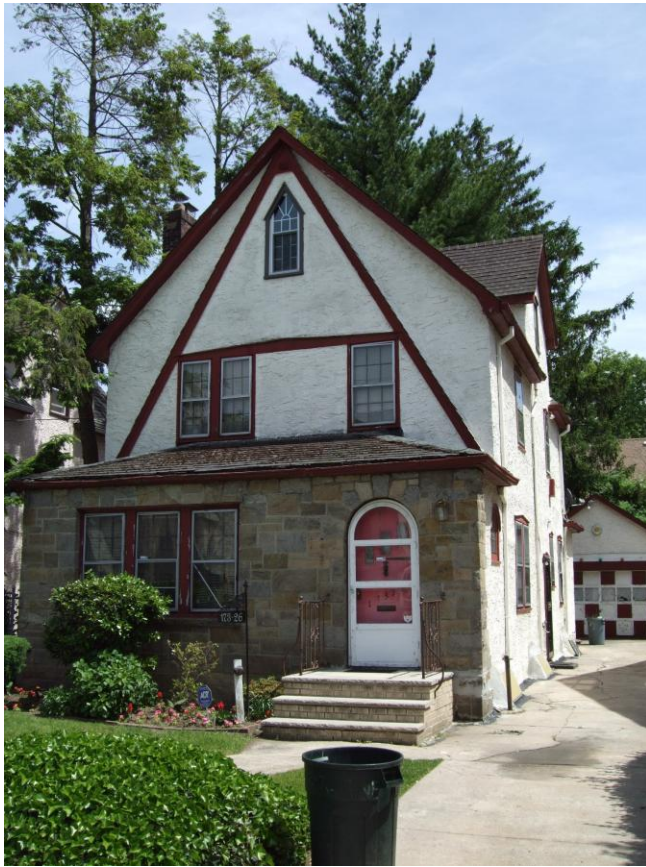
Photo number: 144 Address: 173-26 113 th Avenue Cross streets: between 175 th Street and Marne Place, south side of street Date built: 1929 Notes, if any: none