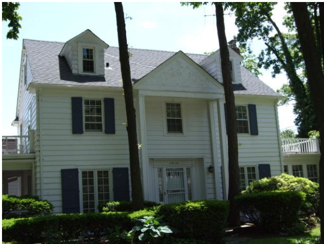
Photo number: 63 Address: 178-06 Murdock Avenue Cross streets: Southeast corner of 178 th street Date built: c. 1930 Notes, if any: none

Photo number: 62 Address: 178-16 Murdock Avenue Cross streets: Southwest corner of 178 th Place Date built: c. 1930 Notes, if any: former home of jazz musician Earl Bostic