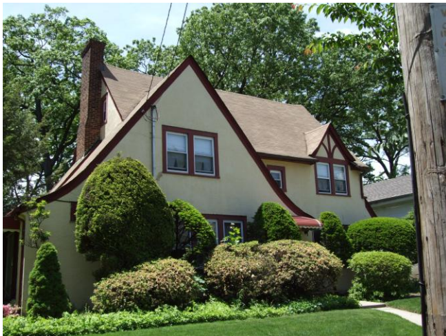
Photo number: 88 Address: 112-40 177 th Street Cross streets: between Murdock and 112 th Avenue, west side of street Date built: 1924 Notes, if any: former home of baseball player Jackie Robinson

Photo number: 87 Address: 112-32 177 th Street Cross streets: between Murdock and 112 th Avenue, west side of street Date built: 1965 Notes, if any: none