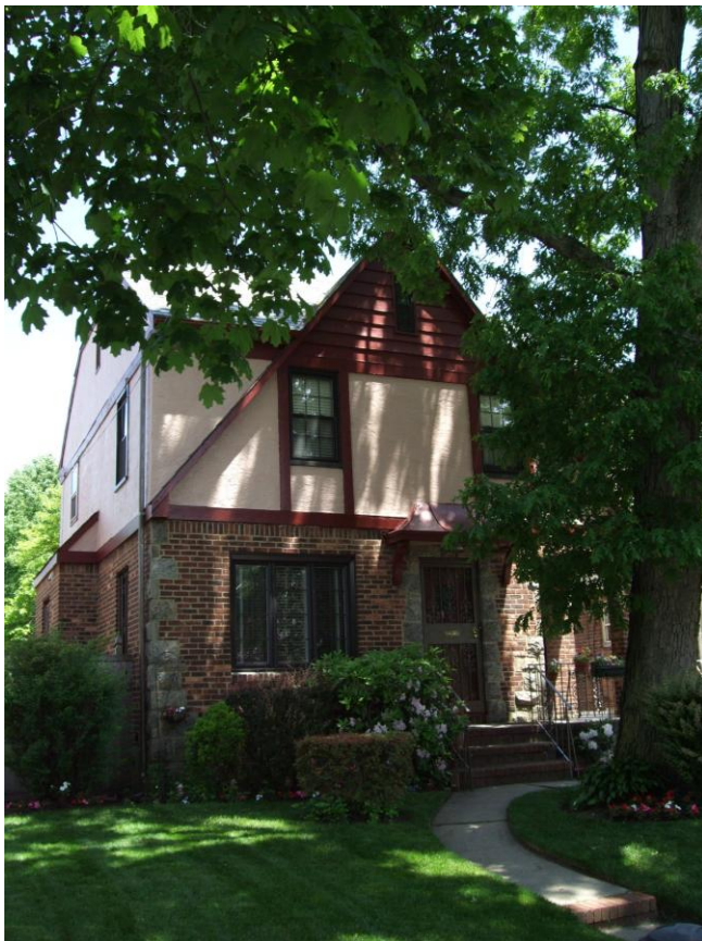
Photo number: 77 Address: 112-15 177 th Street Cross streets: between Murdock and 112 th Avenue, east side of street Date built: 1931 Notes, if any: none

Photo number: 76 Address: 112-19 177 th Street Cross streets: between Murdock and 112 th Avenue, east side of street Date built: 1954 Notes, if any: none