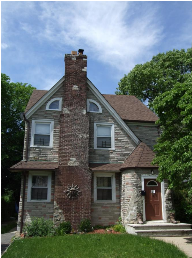
Photo number: 24 Address: 114-14 179 th Street Cross streets: between 114 th Road and Murdock, west side of street Date built: 1916 Notes, if any: none