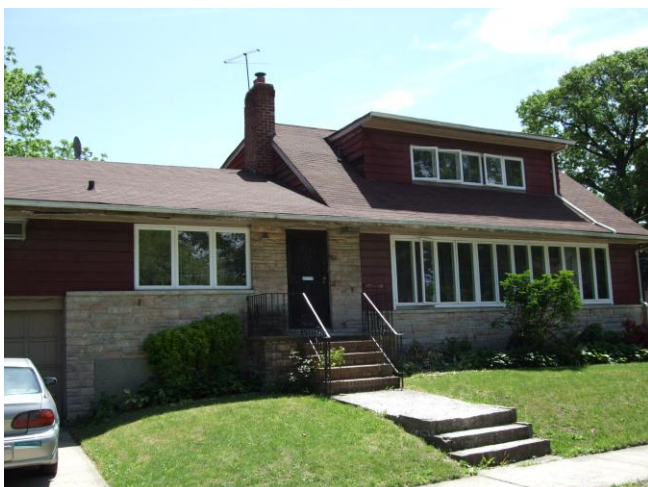
Photo number: 68 Address: 177-06 Murdock Avenue Cross streets: Southeast corner of 177 th Street Date built: 1952 Notes, if any: none

Photo number: 67 Address: 177-14 Murdock Avenue Cross streets: between 178 th Street and 177 th Street, south side of street Date built: 1958 Notes, if any: none