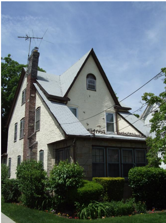
Photo number: 134 Address: 173-19 113 th Avenue Cross streets: between 175 th Street and Marne Place, north side of street Date built: c. 1930 Notes, if any: former home of activist W. E. B. DuBois and author Shirley Graham