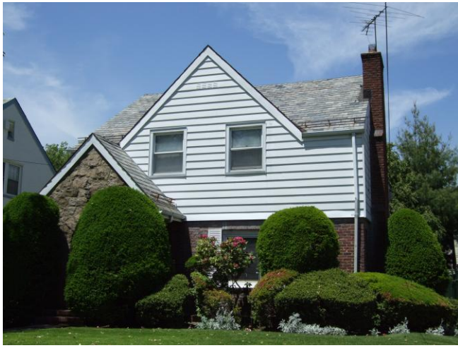
Photo number: 54 Address: 179-11 Murdock Avenue Cross streets: between 180 th and 179 th Streets, north side of street Date built: 1940 Notes, if any: none