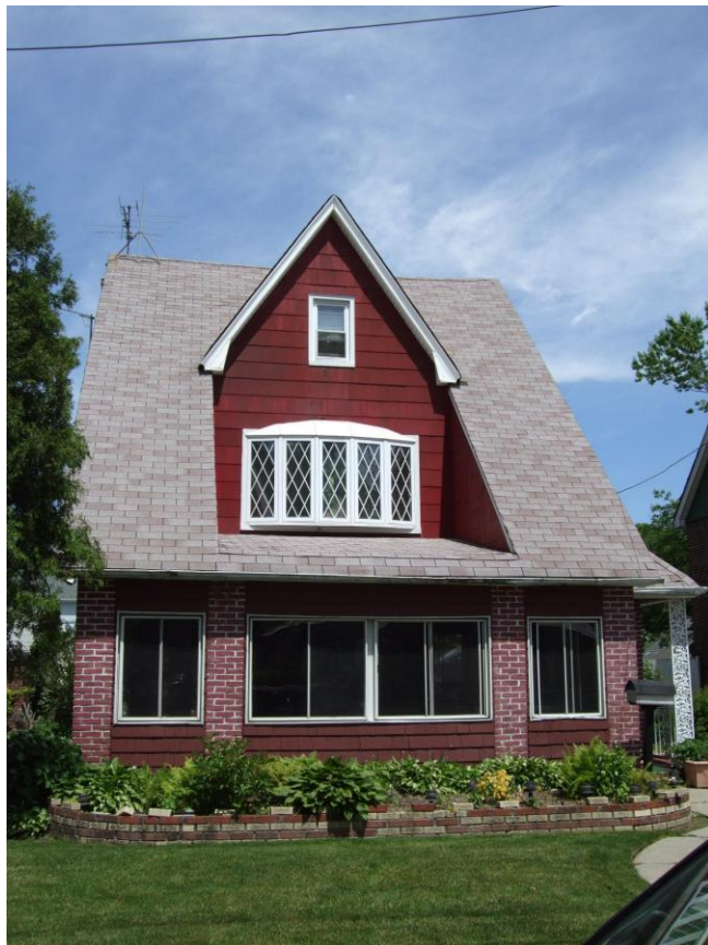
Photo number: 125 Address: 112-25 175 th Street Cross streets: between Murdock Avenue and Adelaide, east side of street Date built: 1927 Notes, if any: none