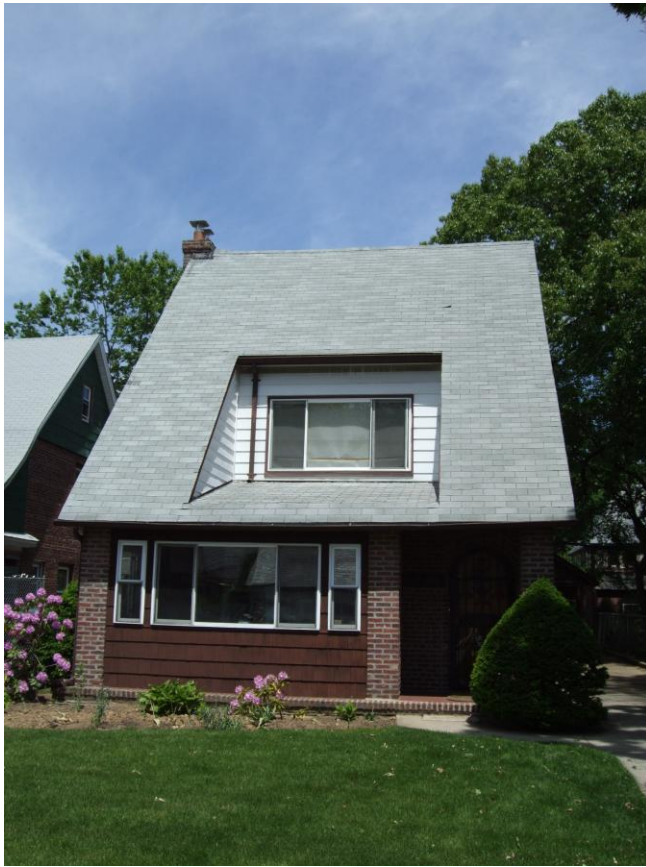
Photo number: 123 Address: 112-35 175 th Street Cross streets: between Murdock Avenue and Adelaide, east side of street Date built: 1927 Notes, if any: none