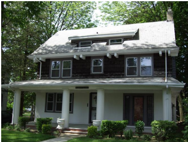
Photo number: 11 Address: 115-14 179 th Street Cross streets: between Linden Blvd and 114 th Road, west side of street Date built: 1920 Notes, if any: none

Photo number: 10 Address: 115-10 179 th Street Cross streets: between Linden Blvd and 114 th Road, west side of street Date built: c. 1920 Notes, if any: none