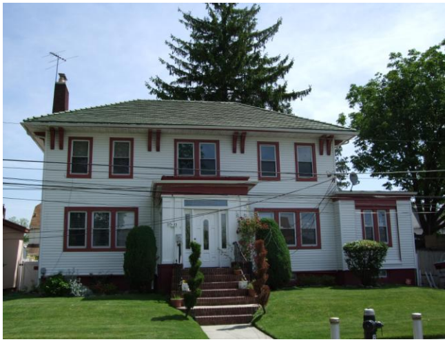
Photo number: 1 Address: 115-33 179 th Street Cross streets: Northeast corner of Linden Blvd. Date built: c. 1920 Notes, if any: none