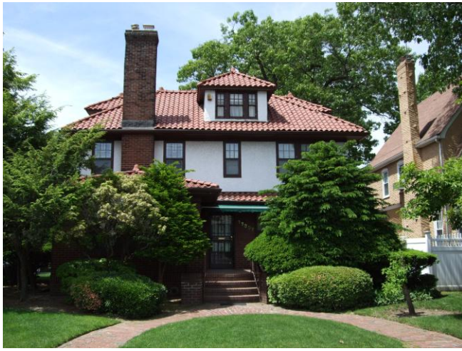
Photo number: 115 Address: 173-07 Murdock Avenue Cross streets: Northwest corner of Marne Place Date built: 1928 Notes, if any: none