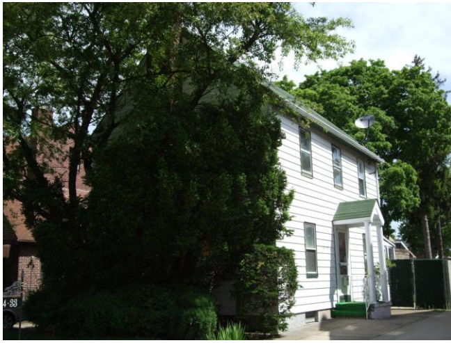
Photo number: 17 Address: 114-33 179 th Street Cross streets: between 114 th Road and Murdock, east side of street Date built: c. 1920 Notes, if any: none