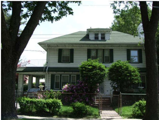
Photo number: 3 Address: 115-25 179 th Street Cross streets: between Linden Blvd and 114 th Road, east side of street Date built: c. 1920 Notes, if any: none

Photo number: 2 Address: 115-29 179 th Street Cross streets: between Linden Blvd and 114 th Road, east side of street Date built: 1914 Notes, if any: none