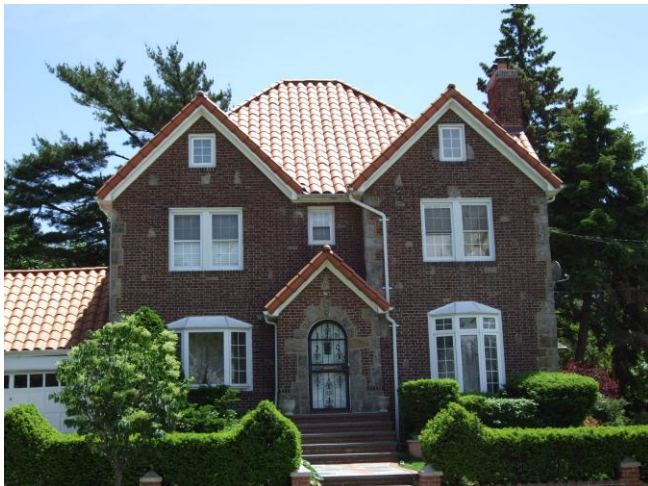
Photo number: 96 Address: 175-30 Murdock Avenue Cross streets: Southeast corner of 175 th Place Date built: c. 1930 Notes, if any: none

Photo number: 95 Address: 175-40 Murdock Avenue Cross streets: between 176 th Street and 175 th Place, south side of street Date built: 1959 Notes, if any: none