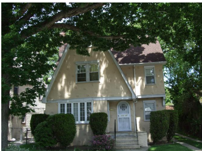
Photo number: 118 Address: 113-07 175 th Street Cross streets: between Murdock Avenue and Adelaide, east side of street Date built: 1928 Notes, if any: none

Photo number: 117 Address: 174-16 Murdock Avenue Cross streets: Southwest corner of 175 th Street Date built: 1927 Notes, if any: none