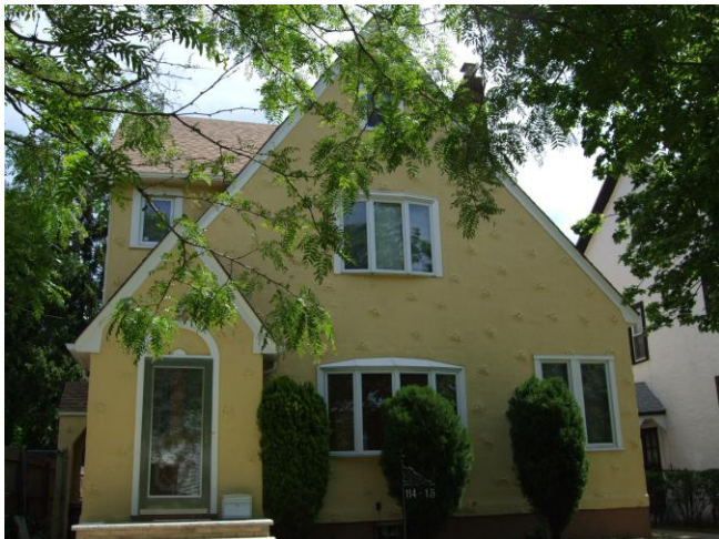
Photo number: 22 Address: 114-15 179 th Street Cross streets: between 114 th Road and Murdock, east side of street Date built: 1928 Notes, if any: none

Photo number: 21 Address: 114-19 179 th Street Cross streets: between 114 th Road and Murdock, east side of street Date built: 1928 Notes, if any: former home of lawyer and politician Percy Sutton