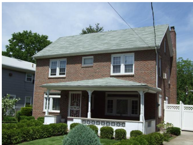
Photo number: 127 Address: 112-15 175 th Street Cross streets: North of Murdock, at intersection of Adelaide Date built: 1927 Notes, if any: none

Photo number: 126 Address: 112-21 175 th Street Cross streets: between Murdock Avenue and Adelaide, east side of street Date built: 1927 Notes, if any: none