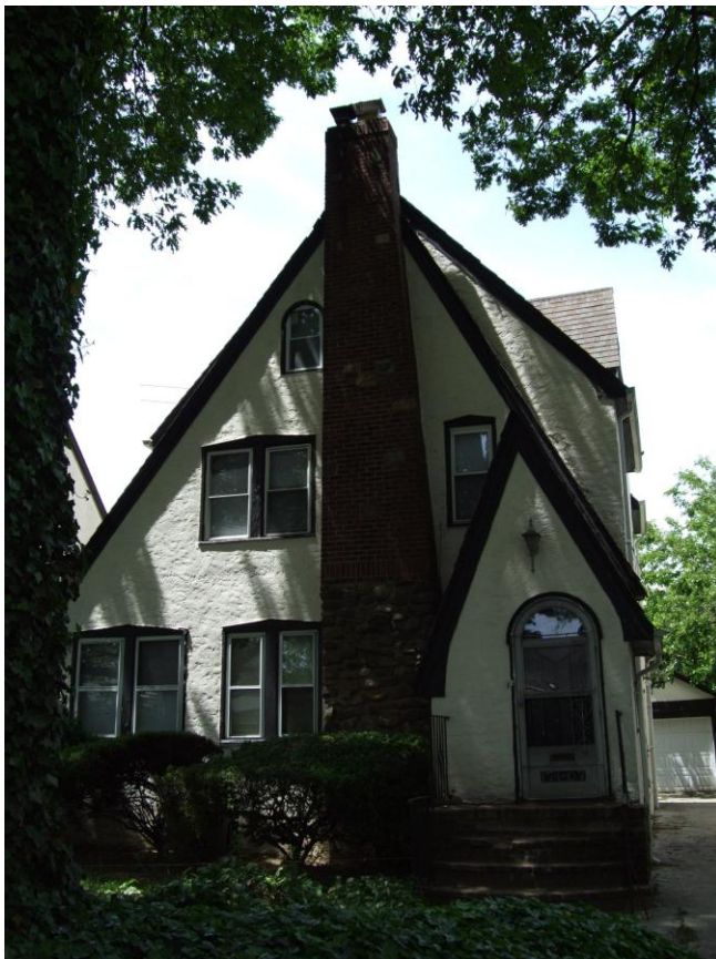
Photo number: 110 Address: 174-07 Murdock Avenue Cross streets: between 175 th Street and Marne Place, north side of street Date built: 1927 Notes, if any: none